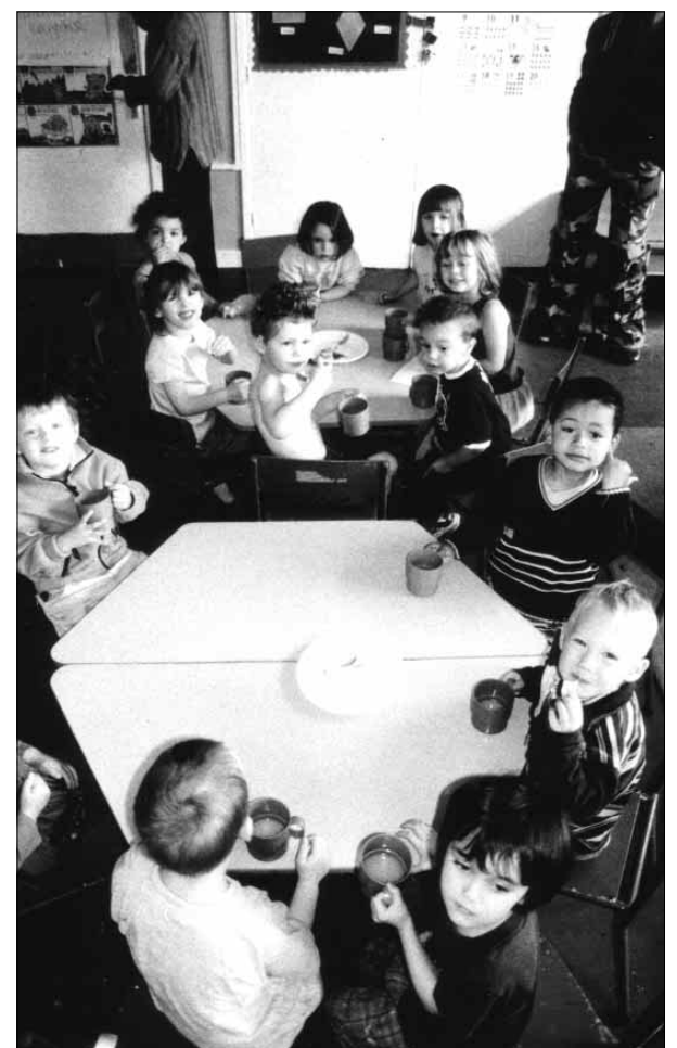
Past and present users – do you recognise anyone?